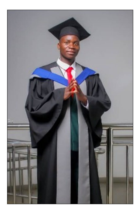
A recent graduate

Please consider a gift to keep the students in school.