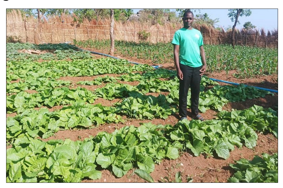
The garden at Katondo

This is a first for Katondo, as it is located in a very dry and rocky area. The solar irrigation system will allow for multiple growing seasons during the year, a scenario that is not common in Malawian farming communities.