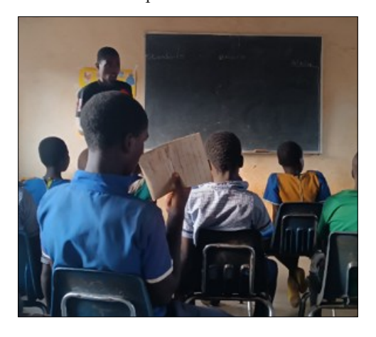
Students in class

I can see God work when I look at the increase in the number of MoH secondary school scholarship students from 295 in 2023